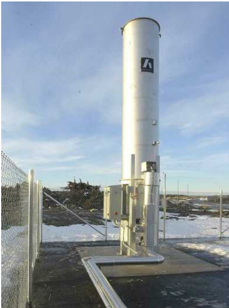
HOFGAS ® - Efficiency 250

Reliable disposal of landfill gas with high safety and quality standard.