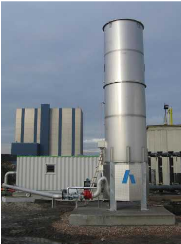
Pump and flare station in container HOFGAS ® - APM 2000

The pump and flare station from Hofstetter as the ideal interface between fermentation and combined heat and power station.