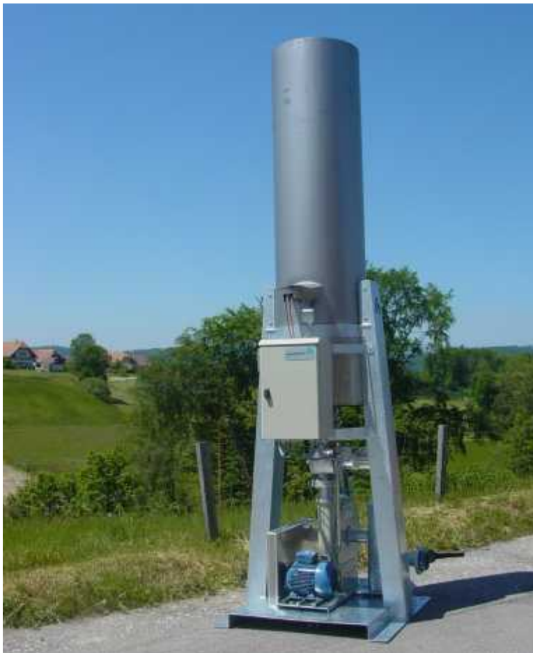
HOFGAS i - Smarty 300

Mobile and compact degassing system for simple requirements.