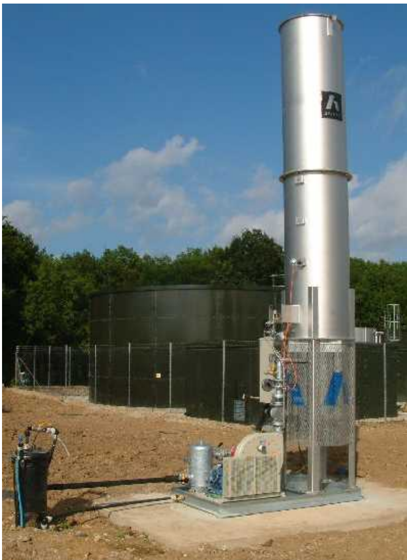
HOFGAS u - Sparky S

Safe, high-level degassing at good value for money.